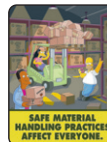
S1128 Warehouse Safety