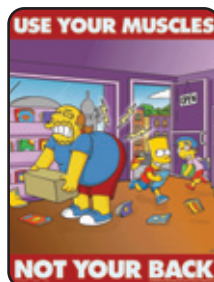
S1123 Back Safety