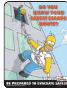
S1102 Emergency Evacuation