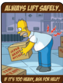
S1122 Lifting Safety