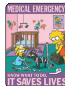
S1126 Medical Emergency