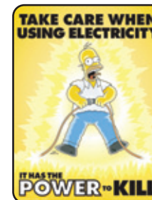
S1120 Electrical Safety