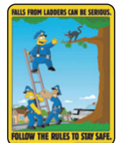
S1127 Ladder Safety