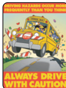
S1124 Driving Safety