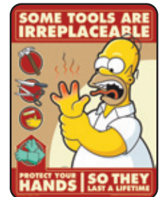
S1121 Hand Safety