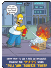
S1117 Fire Safety